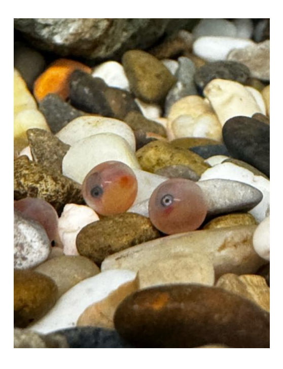
Steelhead eggs maturing in one of GCFF's Trout in the Classroom Tanks